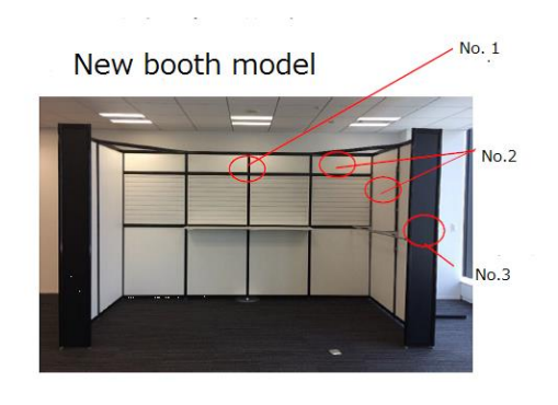
New booth model (from another angle)