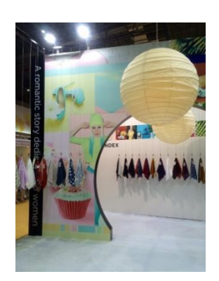
< Intertextile Shanghai 2017SS >