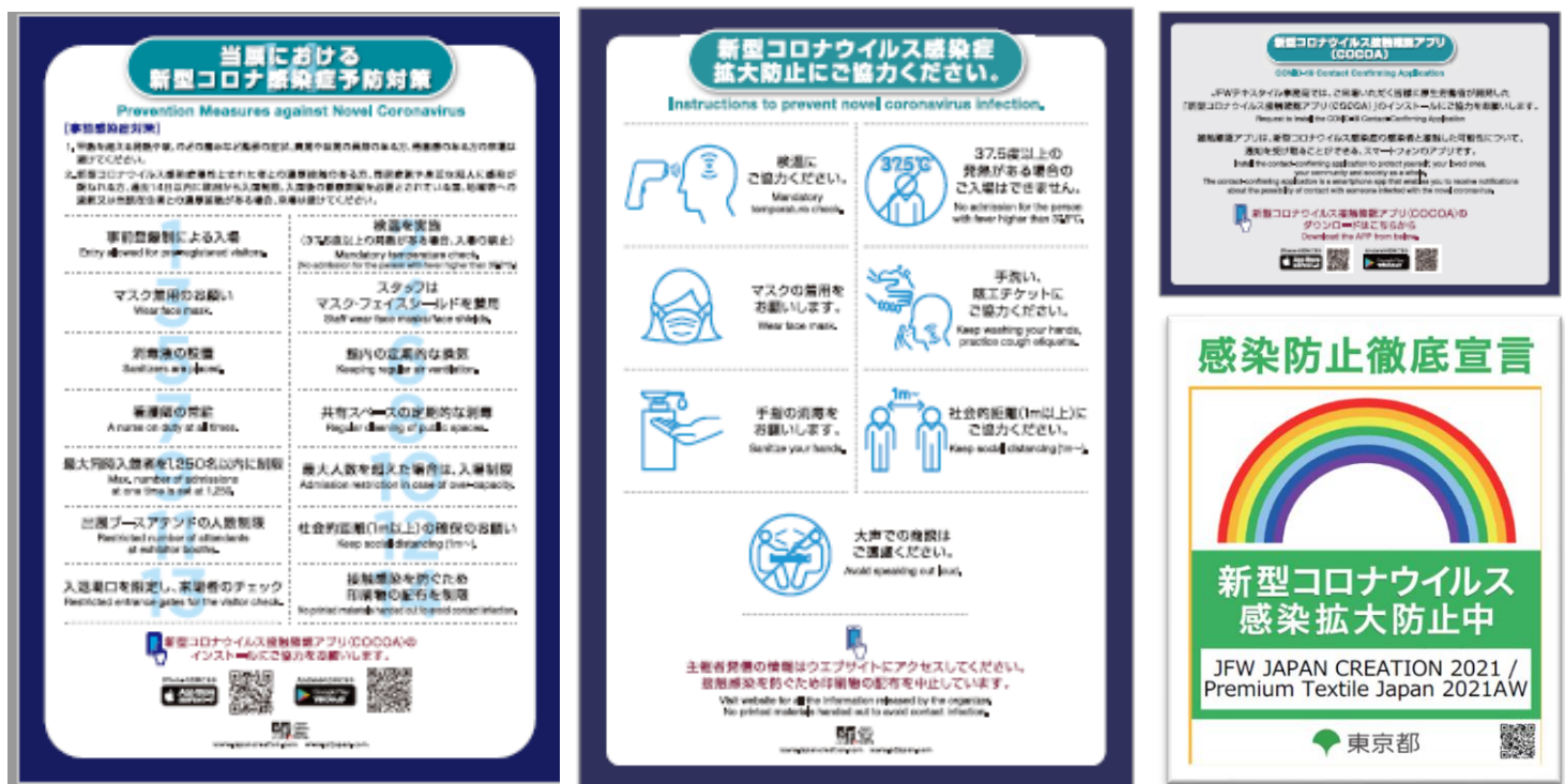
(Infection Prevention Thorough Declaration)