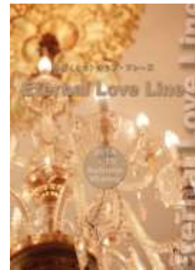
Eternal Love Line